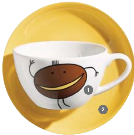
1 417530 Gym Bean 2 700228 Vollfond Gelb