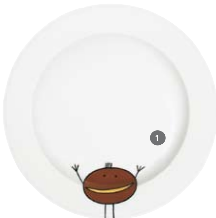
1 417530 Gym Bean