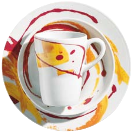
417600 Free Arts