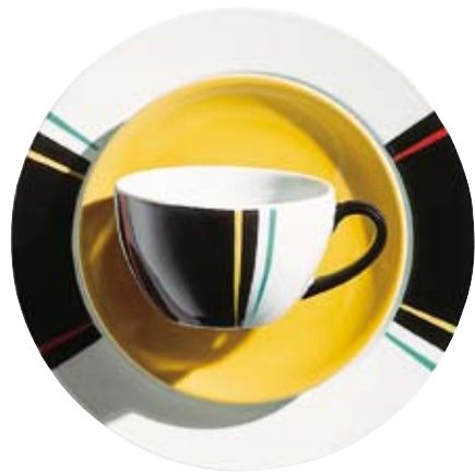
530021 Cafe Nero