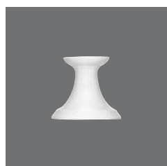
Leuchter , Candleholder, Bougeoir, Candelabro, Candeliere

> Tischvase bauchig 19 8100 5372 - 78 (3.07) 126 200