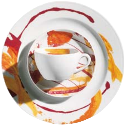
417600 Free Arts