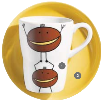
1 417530 Gym Bean 2 700228 Vollfond Gelb