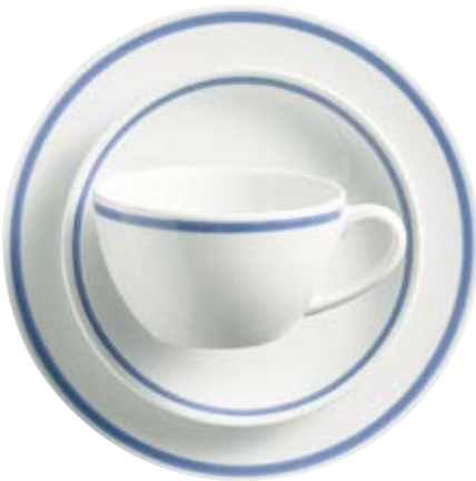
410000 Del Mare Pinselband Blau