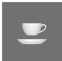
Tasse , Cup and saucer, Tasse et soucoupe, Taza y platito, Tazza e piattino