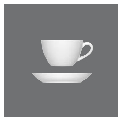
Tasse , Cup and saucer, Tasse et soucoupe, Taza y platito, Tazza e piattino