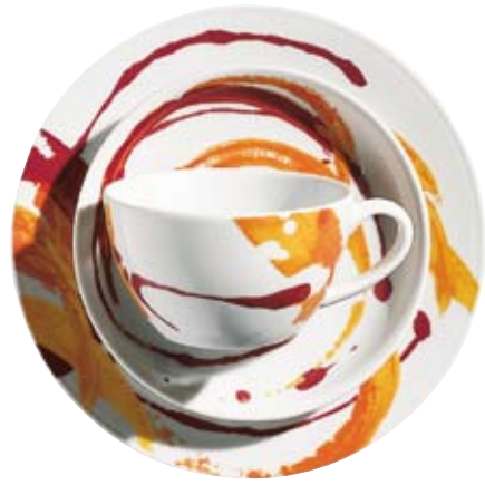
417600 Free Arts