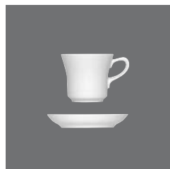
Tasse Glockenform , Cup high and saucer, Tasse haute et soucoupe, Taza alta y platito, Tazza alta e piattino