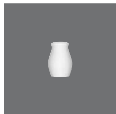
Pfefferstreuer , Pepper shaker, Poivrière, Pimentero, Spargi pepe

> Salzstreuer 55 4010 5528 - 47 (1.85) 69 60