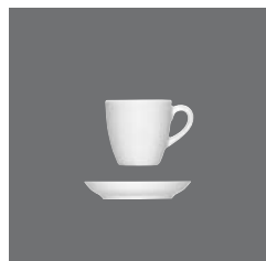
Tasse , Cup and saucer, Tasse et soucoupe, Taza y platito, Tazza e piattino