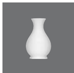
Tischvase , Flower vase, Vase à fleurs, Florero, Vaso per fiori

> Pfefferstreuer 55 4020 5529 - 47 (1.85) 69 60