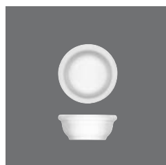
Butternapf , Butter dish, Beurrrier, Plato mantequilla, Coppetta burro