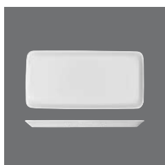
Platte rechteckig , Platter rectangular, Plat rectangular, Fuente rectangular, Piatto quadrato