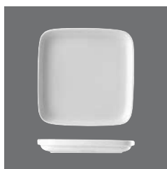
Teller flach quadratisch , Plate flat square, Assiette plate carrée, Plato llano cuadrado, Piatto piano quadrato