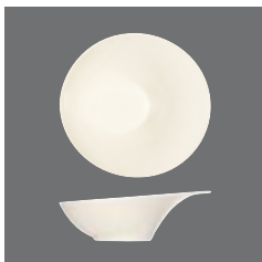
Schale rund , Bowl round, Ravier ronde, Bowl redondo, Coppa rotonda