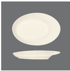
Platte oval Fahne , Platter oval with rim, Plat oval à l'aile, Fuente oval con asa, Piatto ovale con falda