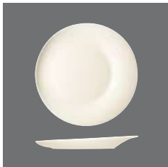
Teller flach rund, asymmetrische Fahne , Plate flat with asymmetrical rim, Assiette plate avec l'aile asymétrique, Plato llano con ala asimétrica, Piatto piano con falda asimmetrica