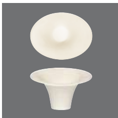
Schale Spezial hoch , Bowl special tall, Ravier spéciale haute, Bowl especial alta, Coppa speciale alta