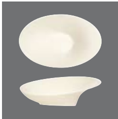
Schale oval , Bowl oval, Ravier ovale, Bowl oval, Coppa ovale