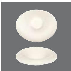
Schale Spezial , Bowl special, Ravier spéciale, Bowl especial, Coppa speciale