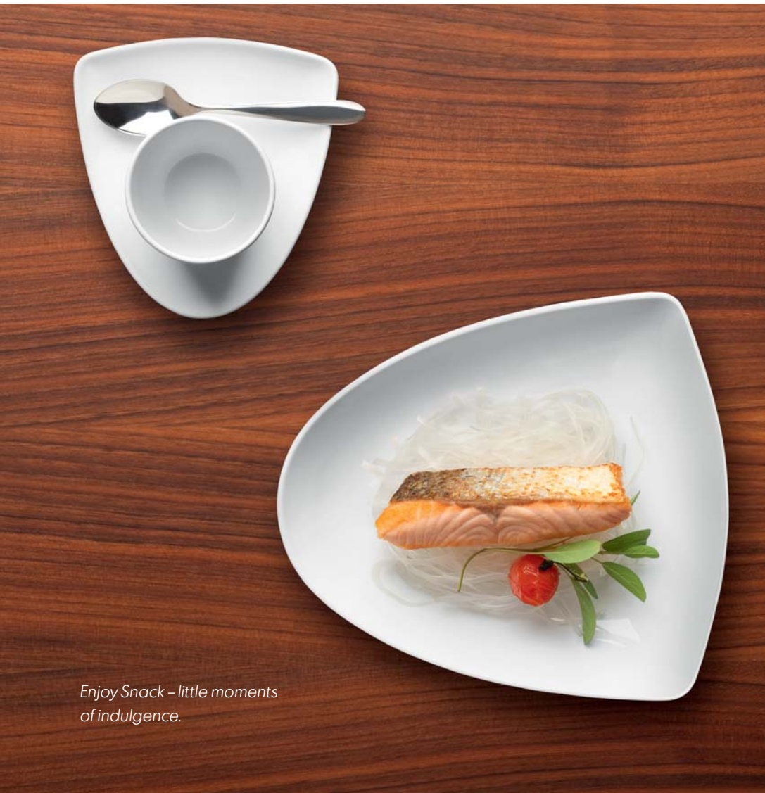
Enjoy Snack – little moments of indulgence.

With the Enjoy collection, Bauscher is making a deliberate statement in the world of hot beverages and snack culture. For example, the two generously designed, asymmetric plates – deep and flat – are excellently suited to serving all kinds of snacks, from soup or salad and light pasta dishes to classic sandwiches. They provide an extraordinary frame, get the guest's attention, and turn little sweet or savoury snacks into a special experience.