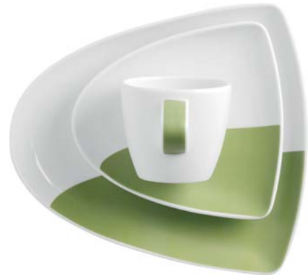
424520 Dekoridee Vela