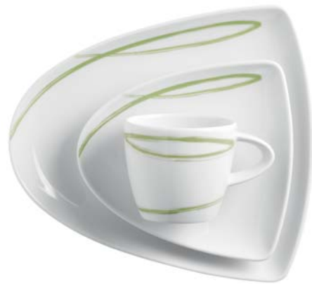
424530 Dekoridee Loom