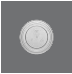
Kunststoffdeckel , Plastic cover, Couvercle en plastique, Tapa plástica, Coperchio plastica