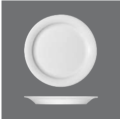
Teller flach Fahne , Plate flat with rim, Assiette plate avec l'aile, Plato llano con ala, Piatto piano